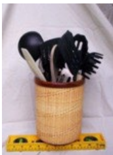
Small Utensil 6" Small Utensil $105.00

The Utensil Nantucket is one of the easiest and most useful Nantucket's to have and make. They come in 3 sizes: 6", 8" and 10" and are made with hardwood and cane. To weave the 10" please call Denise. The 8" and 10" are nail on rims