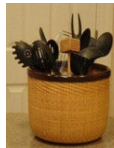
Large Utensil 10" Large Utensil $234.25

The Antique Tray Set The antique tray set consists of three beautiful round moulds; they are 10", 12", and 14 inches in diameter. The one shown at the left is the 12" round tray made on the 12" antique mould. Make one or the set! They are made of hardwood for the base and rims and cane for the stakes and weavers.