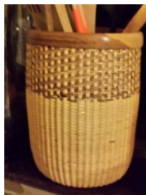
Jude's Utensil 8" Jude's Utensil $155.50